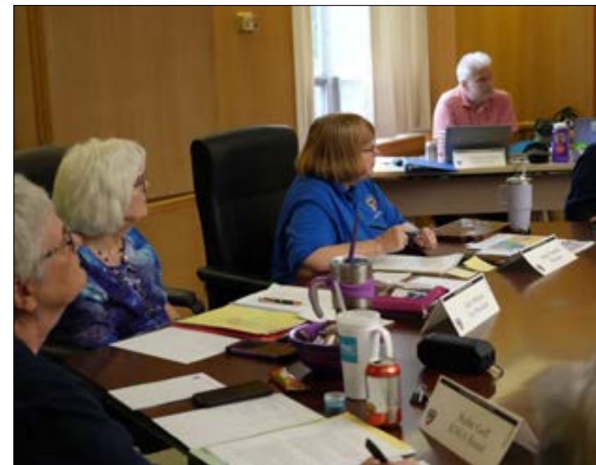
KNEA-R had its Coordinating Council meeting in September. Several retired members also joined a legislative luncheon in August. Finally, retired members spent the day at the KNEA Racial and Social Justice Summit.