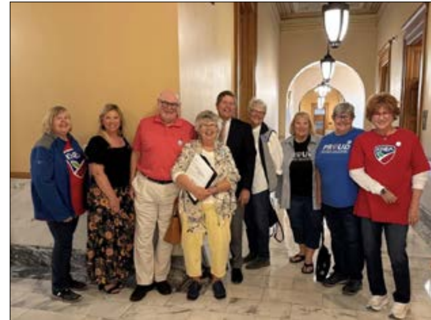
Thanks to all retired members who attended the Joint Committee on Pensions, Investments and Benefits on Oct. 14. We heard promising discussions on KPERs. The work is not over! Follow ksretirees.org to help us continue to advocate for a KPERs Cost of Living Adjustment (COLA).