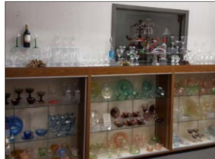
NDGA National Glass Museum