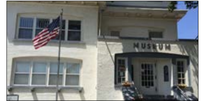
Chisholm Trail Museum

After lunch at Fabiola's Authentic Mexican Restaurant, our group arrived at the Chisholm Trail Museum. This museum is home to 20,000 artifacts from Kansas pioneer days!